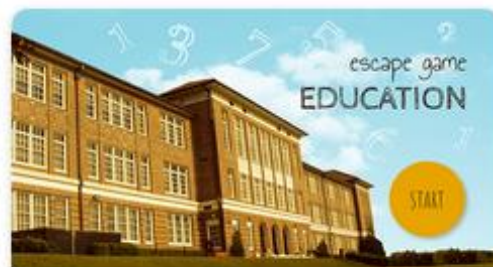
ESCAPE GAME EDUCATION