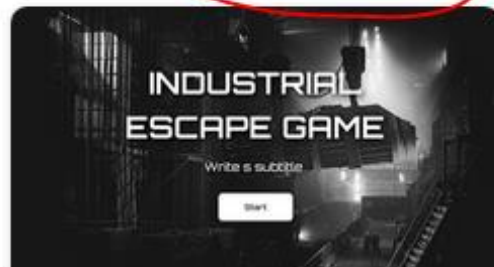
ESCAPE GAME FACTORY