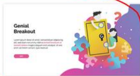
GENIAL VIBRANT BREAKOUT